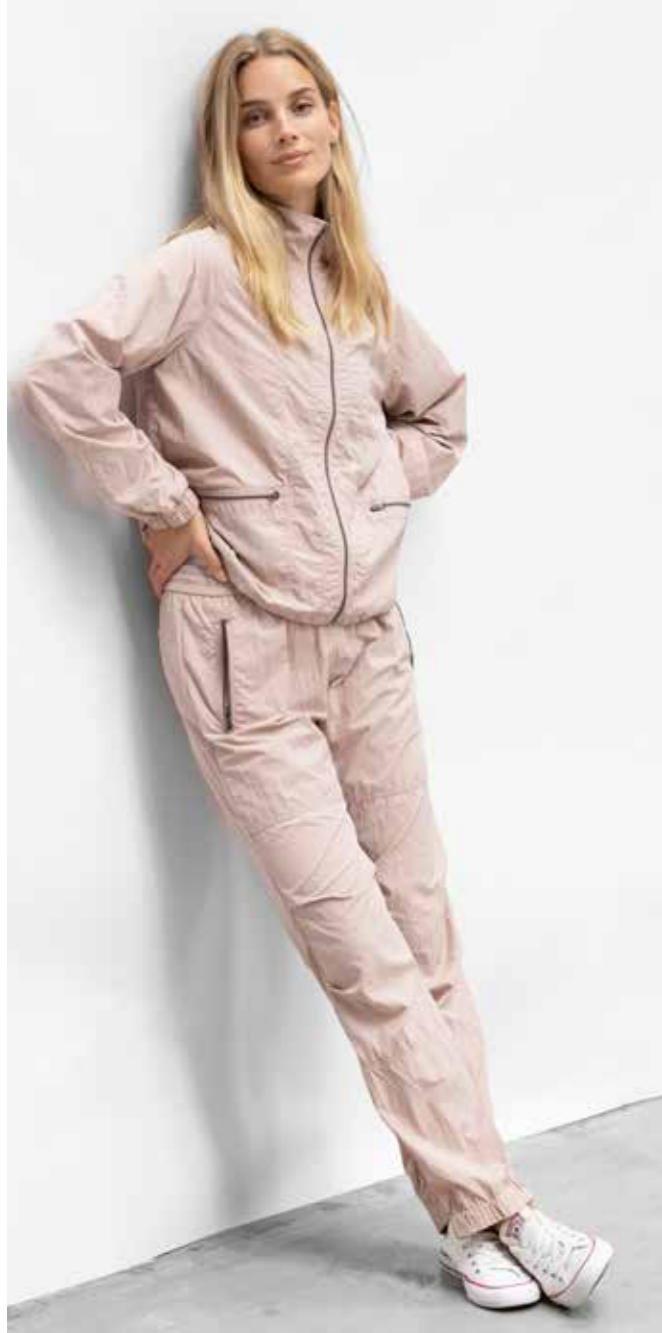
PHOTO 40 240104 ANNA JACKET SMOKED POWDER 240105 ANNA PANTS SMOKED POWDER