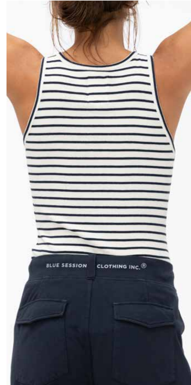
PHOTO 15 240157 SOREL RIB TANK TOP ECRU/NEW NAVY STRIPES 240176 BINE ANCKLE CUT PANTS NEW NAVY