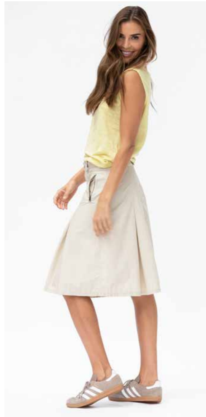
PHOTO 48 240143 AMY TOP GOLDEN MIST 240117 ANNIE SKIRT CHALK