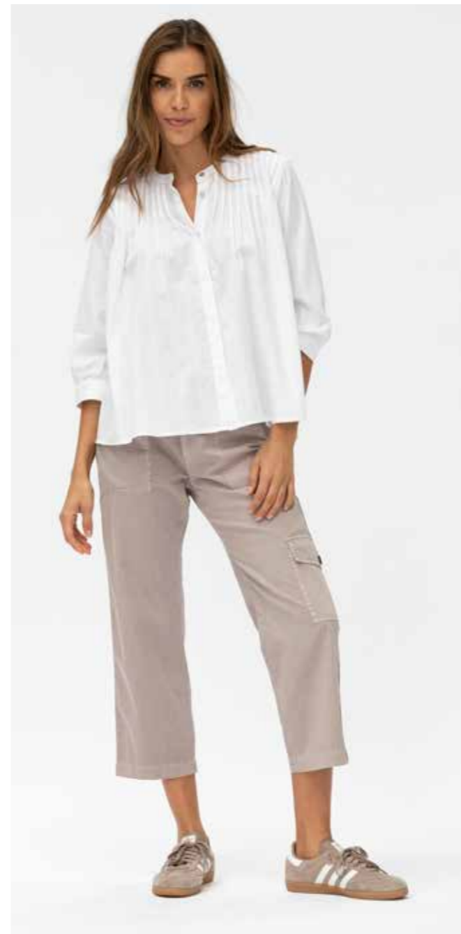
PHOTO 39 240130 ATHENE SHIRT WHITE 240119 ANEKE PANTS SMOKED POWDER