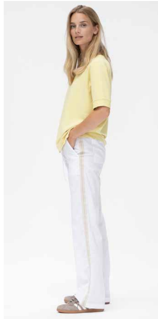
PHOTO 49 2401075 BINE BLOUSE GOLDEN MIST 240114 ANNEMARIE TROUSERS WHITE WITH TAPE