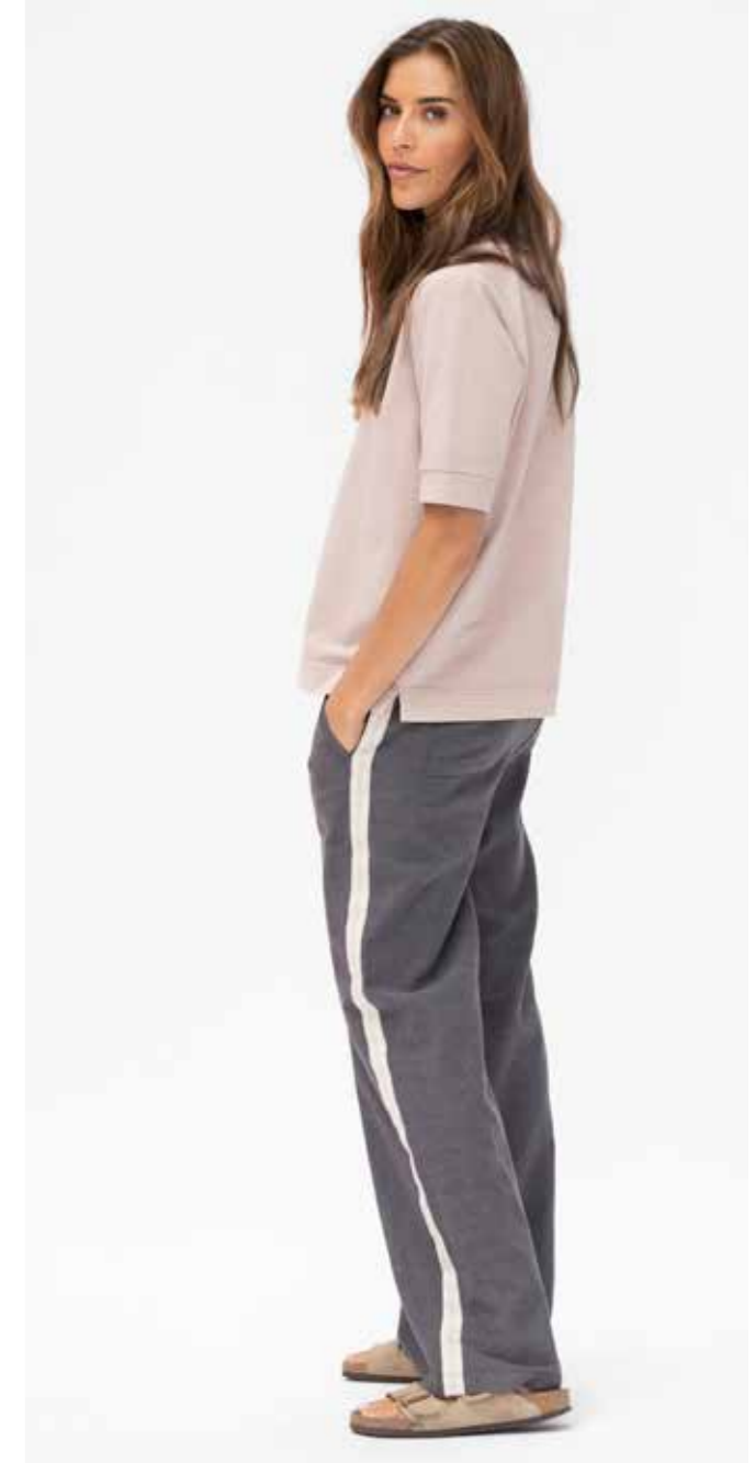
PHOTO 45 240175 BINE BLOUSE SMOKED POWDER 240114 ANNEMARIE TROUSERS IRON GREY WITH TAPE