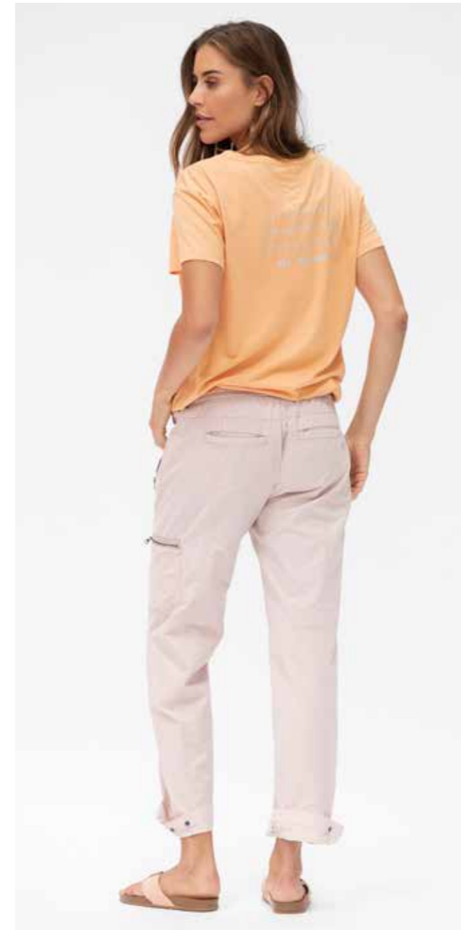
PHOTO 50 240136 ALPHA TEE SUNRISE 240154 ADDISON PANTS SOFT ROSE