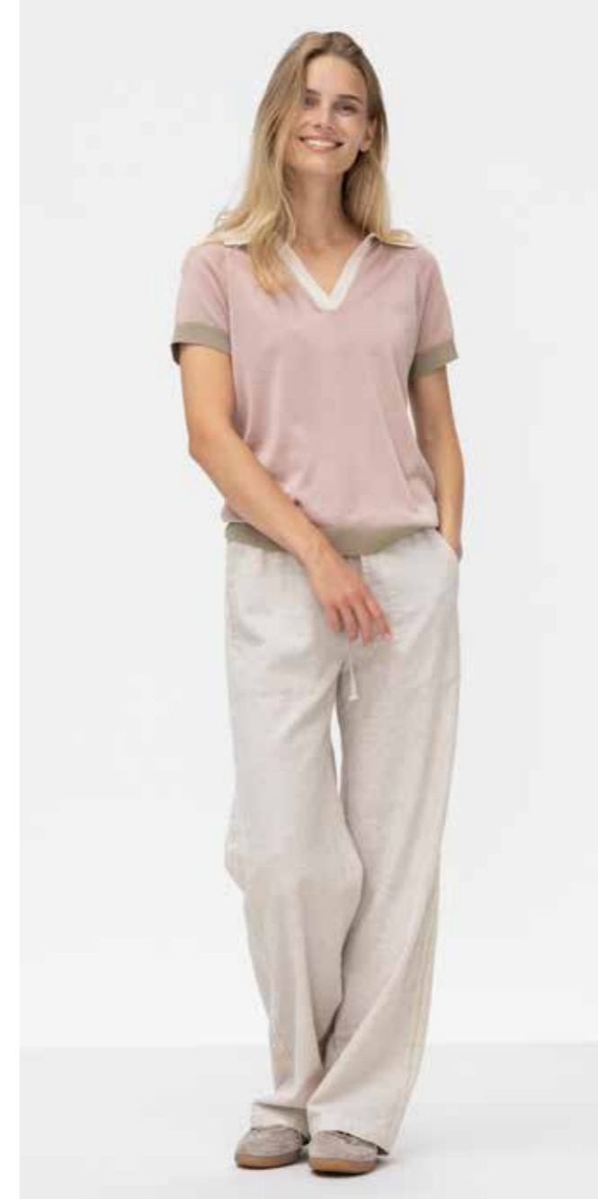
PHOTO 44 240112 AIA POLO KNIT SMOKED POWDER 240114 ANNEMARIE TROUSERS CHALK MELANGE WITH TAPE