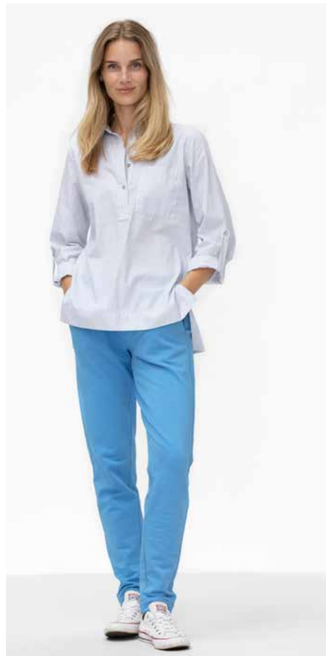
PHOTO 8 1240126 ARIANA SHIRT HEAVEN STRIPED 240190 BLUE ICON PANTS FRESH BLUE