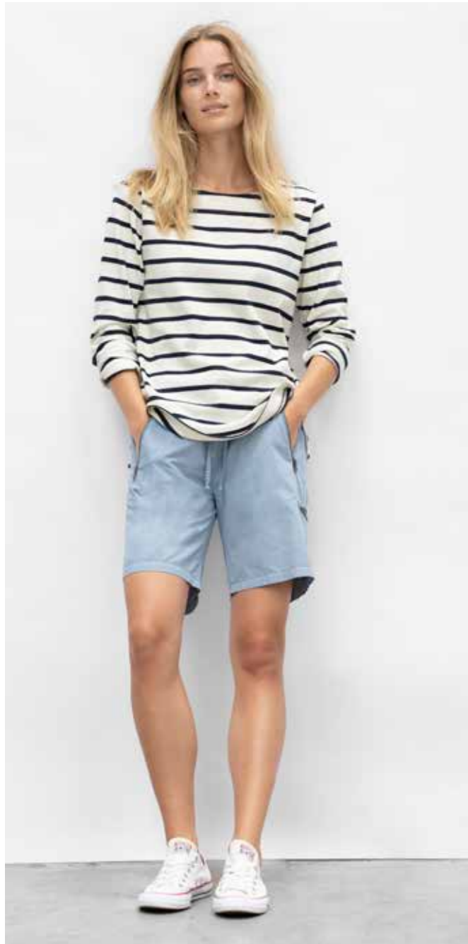
PHOTO 11 240150 ASMA BLOUSE ECRU/NEW NAVY STRIPES 240155 ADDISON SHORTS ASHLEY BLUE