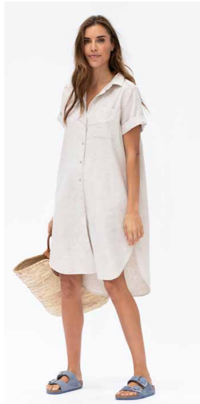
PHOTO 27 230166 JULIANA DRESS CHALK MELANGE