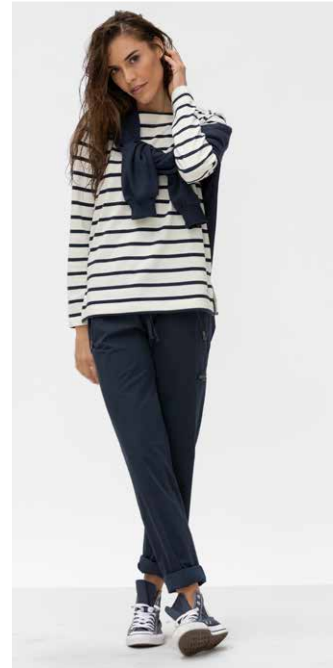
PHOTO 16 240150 ASMA BLOUSE ECRU/NEW NAVY STRIPES 240154 ADDISON PANTS NEW NAVY