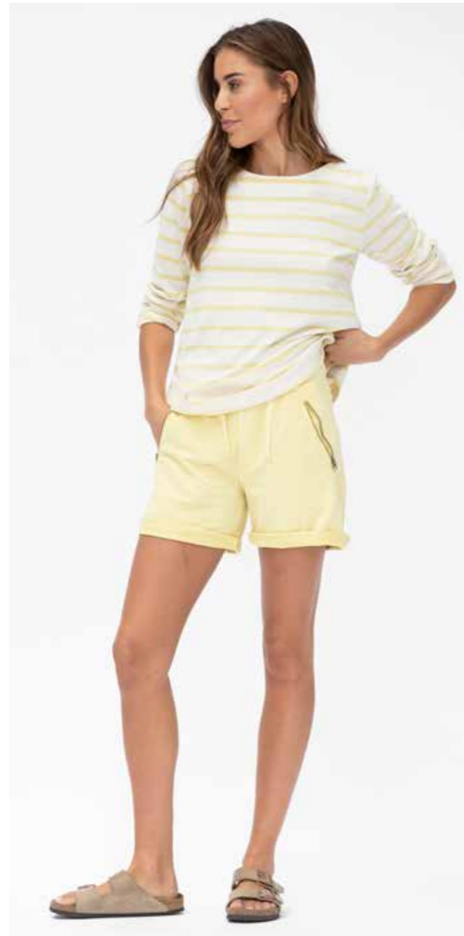
PHOTO 47 240150 ASMA BLOUE ECRU/GOLDEN MIST STRIPES 240177 BINE SHORTS GOLDEN MIST