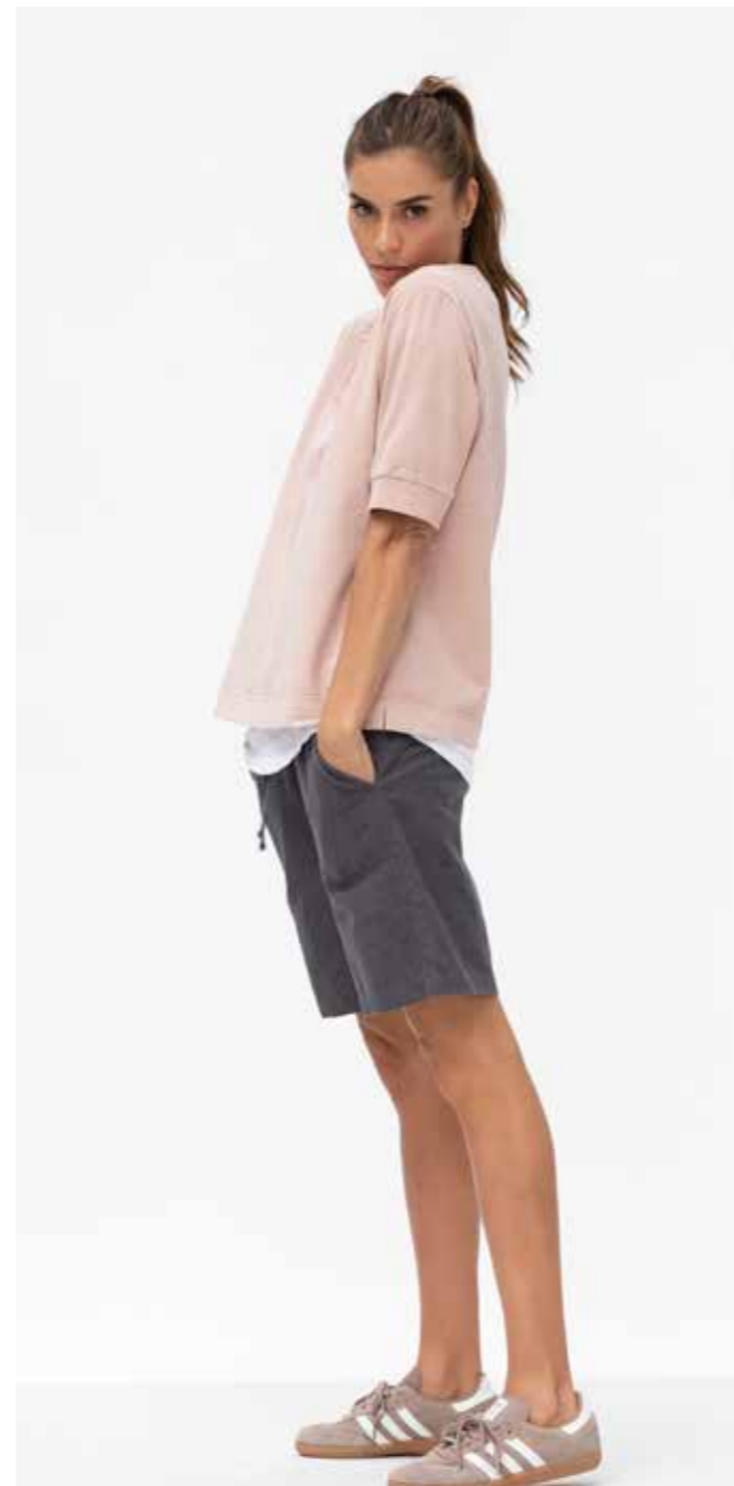
PHOTO 38 240175 BINE BLOUSE SMOKED POWDER 1240123 ANTONIE SHORTS IRON GREY