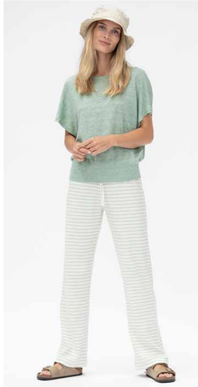
PHOTO 19 240111 ASTA KNIT SPRING GREEN MELANGE 240132 ALETTE RIB PANTS ECRU/SPRING GREEN STRIPES