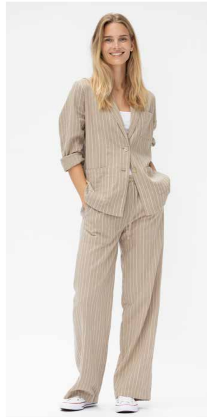
PHOTO 28 240148 ANNEISE BLAZERS DARK KHAKI/KIT STRIPED 240121 ANISETTE TROUSERS DARK KHAKI/KIT STRIPED