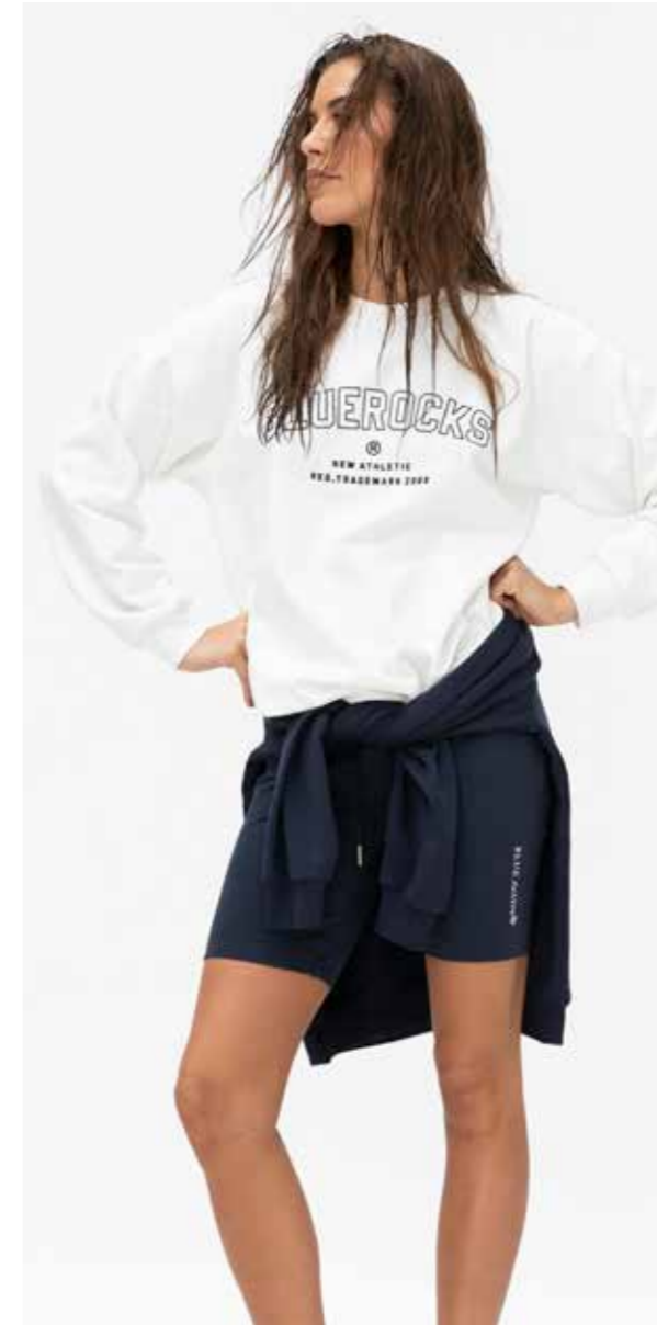
PHOTO 5 240166 BETT SWEAT MILK 240167 BIBA TIGHTS NEW NAVY