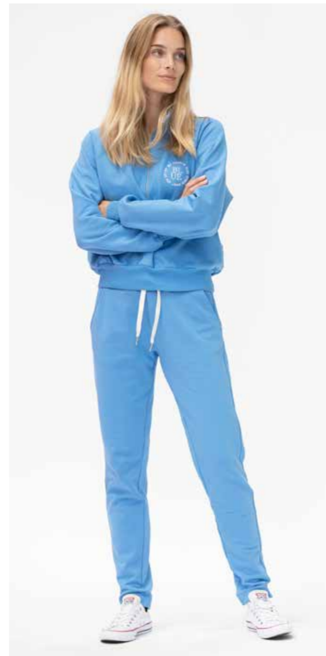
PHOTO 10 240160 BEATE SWEAT FRESH BLUE 240190 BLUE ICON PANTS FRESH BLUE