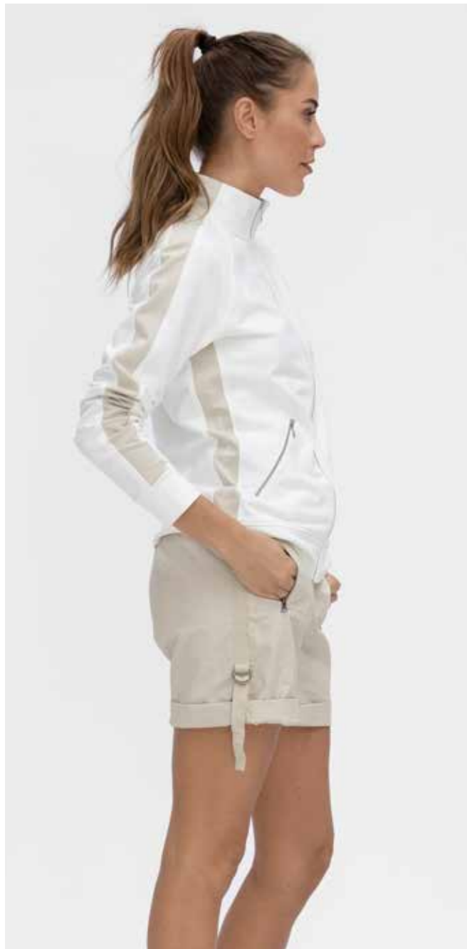
PHOTO 31 240161 BIANCA SWEAT JACKET MILK 240118 ANITA SHORTS CHALK