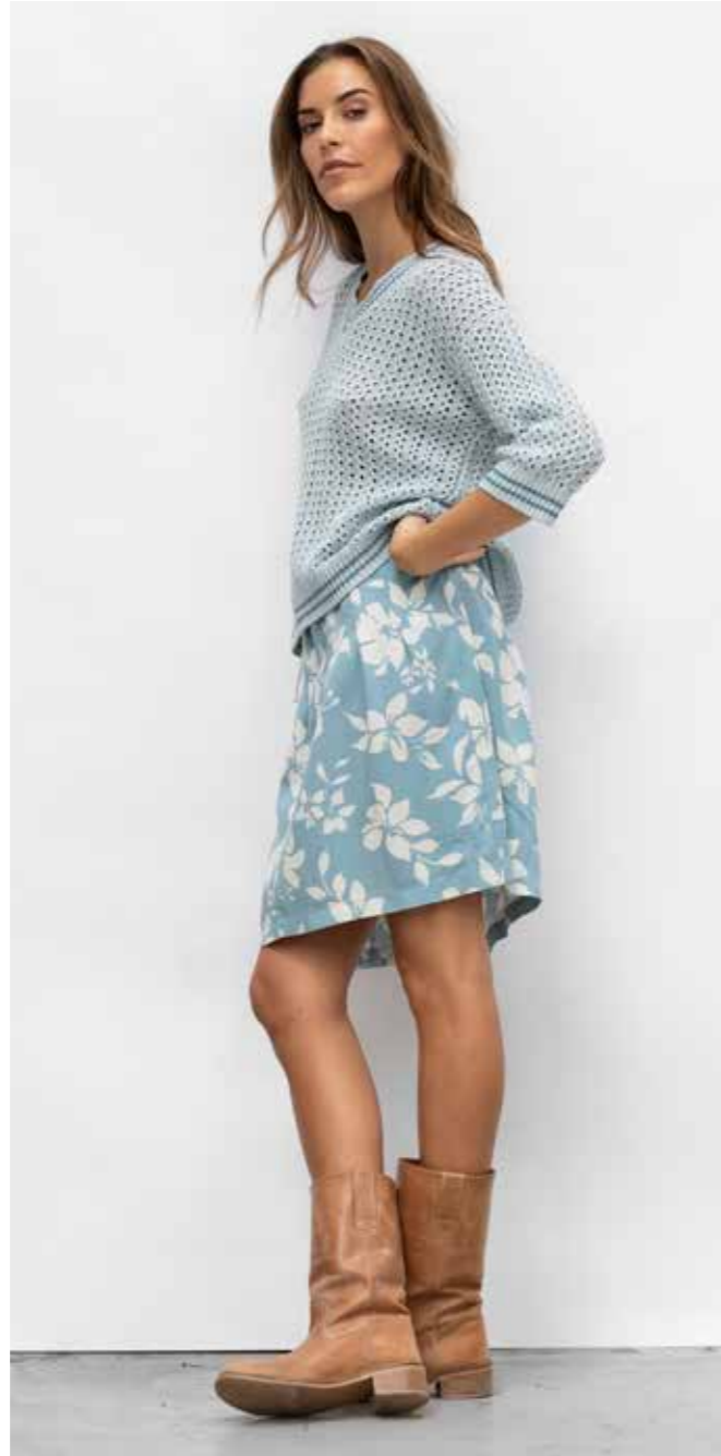
PHOTO 21 240113 ALEXANDRA KNIT SEA 2240120 ANEMONE SKIRT SEA