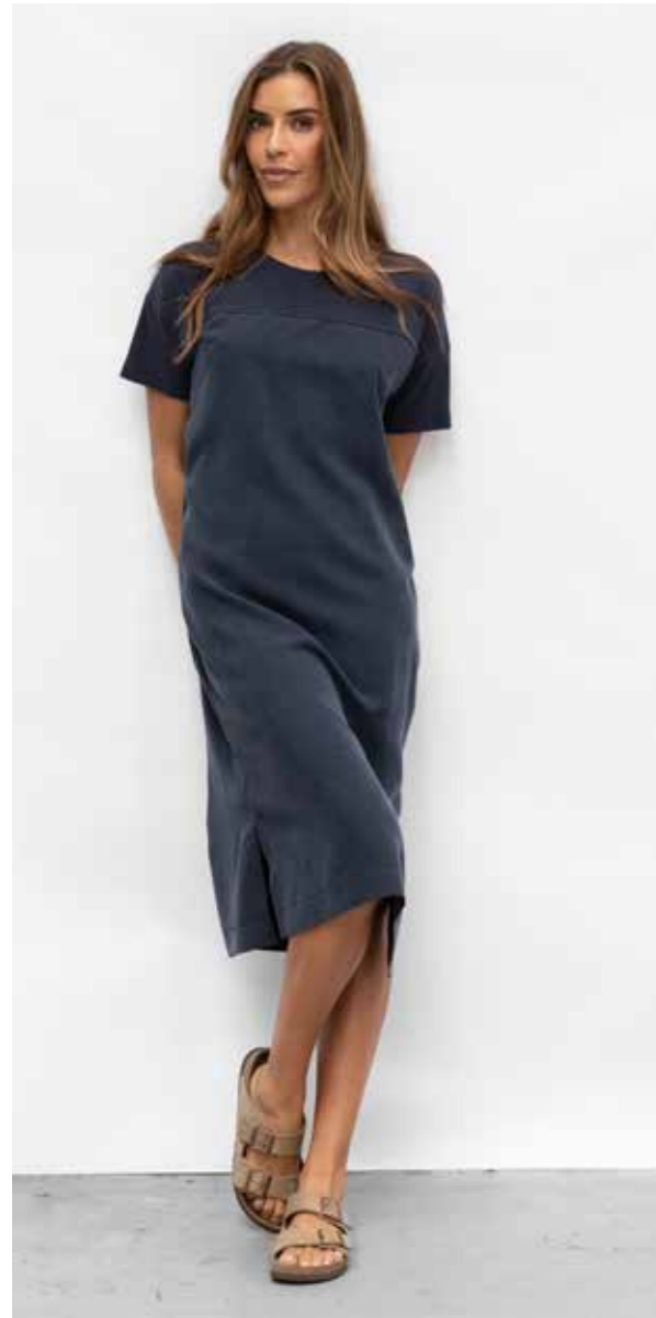
PHOTO 1 240140 ALMIRA DRESS NEW NAVY