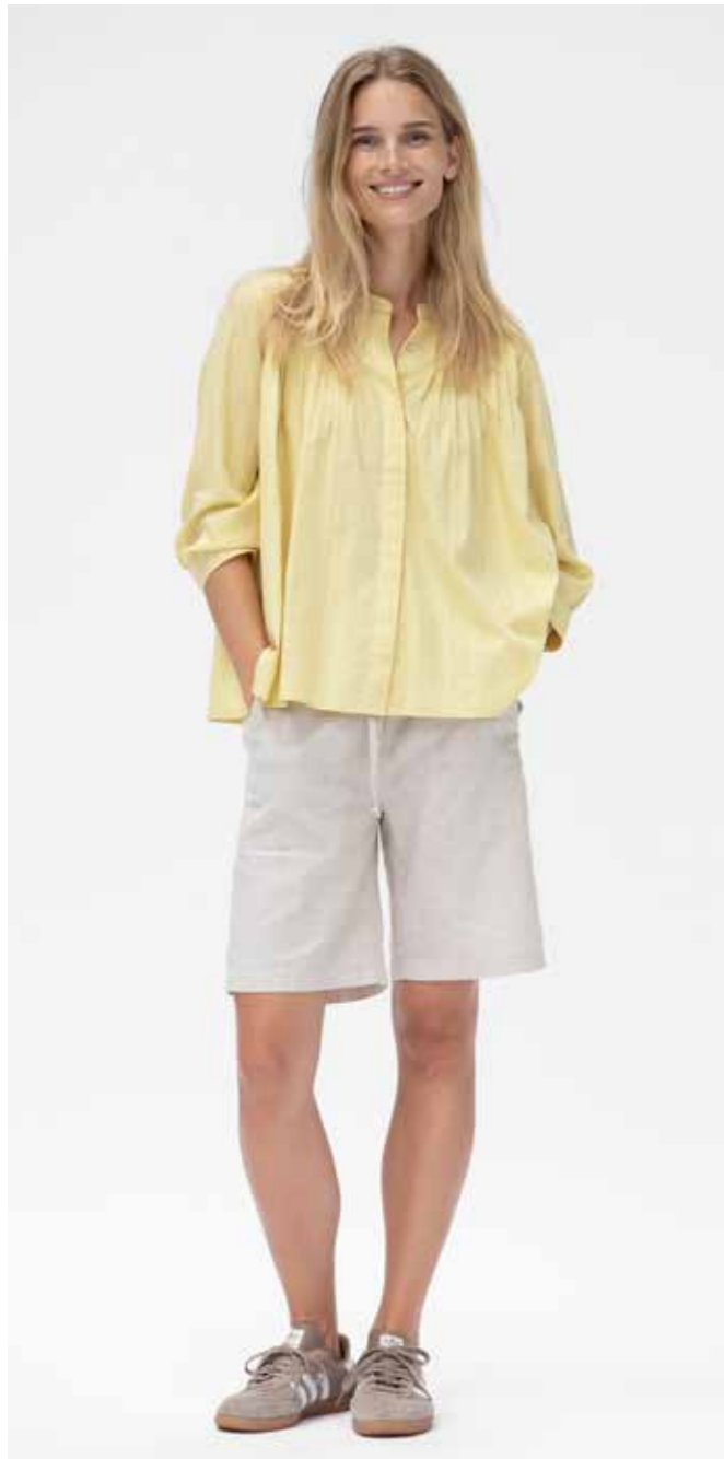
PHOTO 46 240130 ATHENE SHIRT GOLDEN MIST 240123 ANTONIE SHORTS CHALK MELANGE WITH TAPE