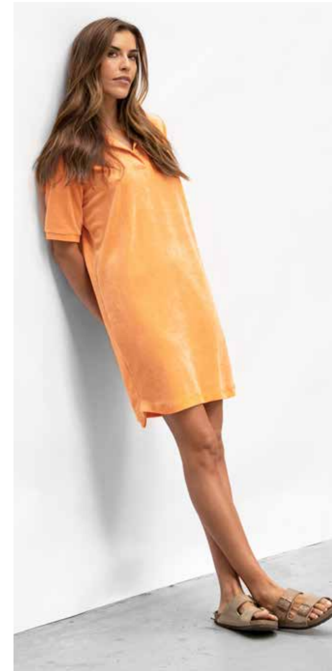
PHOTO 51 240182 BIRKA VELVET POLO DRESS SUNRISE