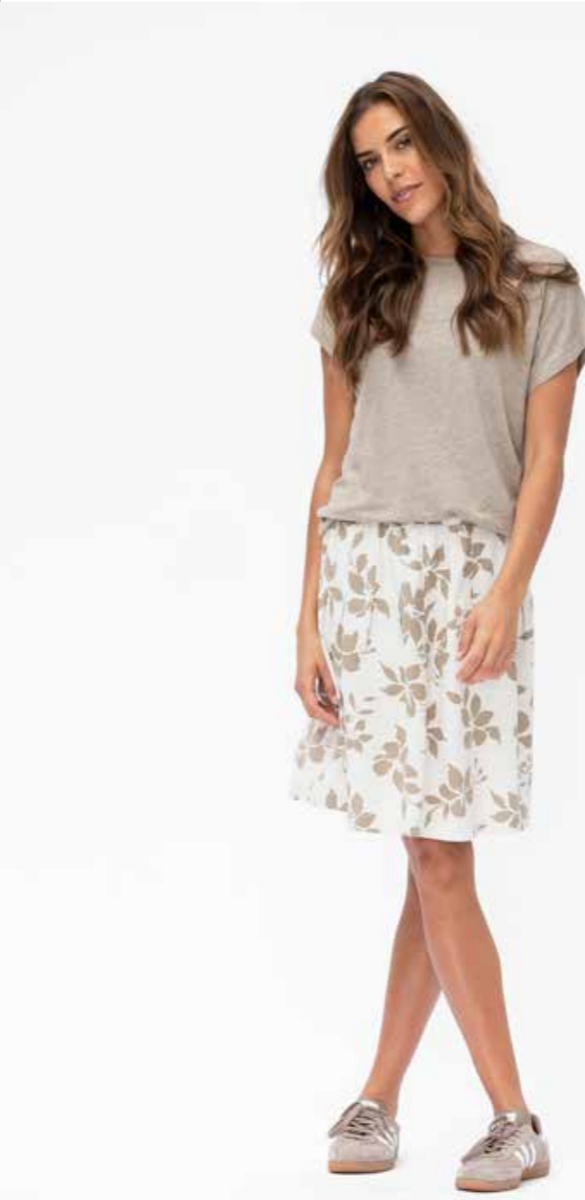
PHOTO 24 240144 ANNABEL TEE DARK KHAKI 2240120 ANEMONE SKIRT KIT