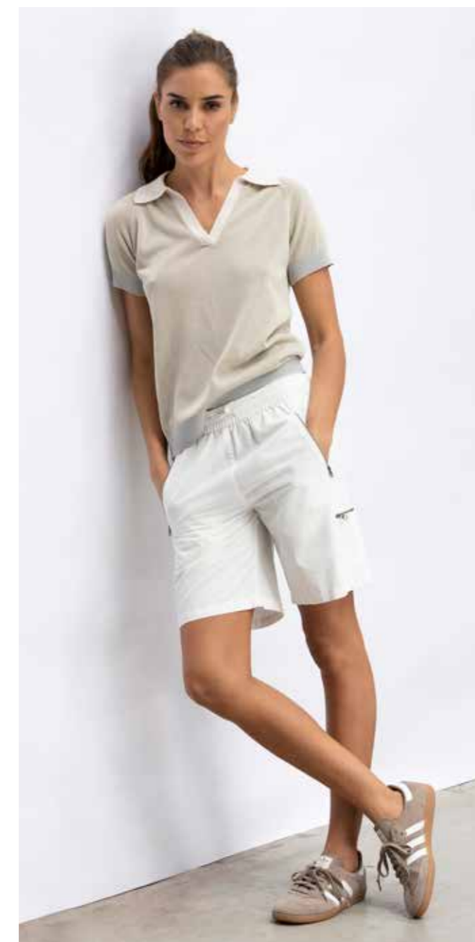
PHOTO 25 240112 AIA KNIT CHALK 240155 ADDISON SHORTS WHITE