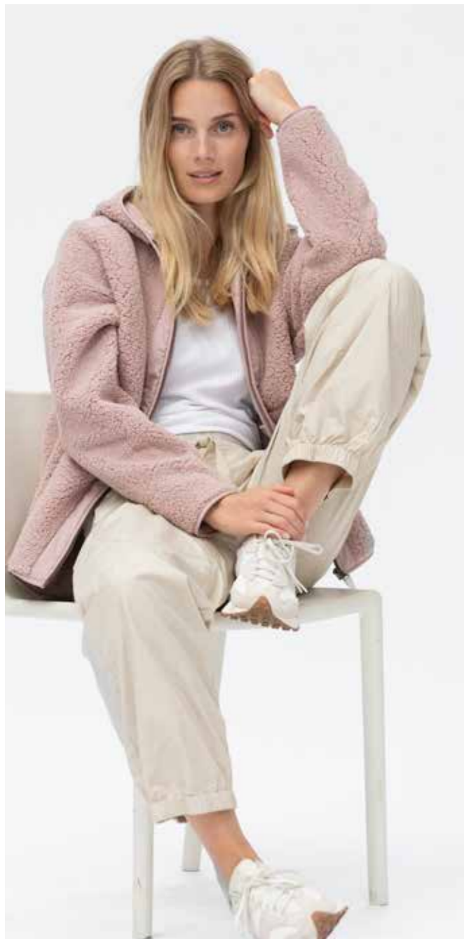
PHOTO 36 240103 ARVEN TEDDY JACKET SMOKED POWDER 240116 ANIKA TROUSERS CHALK