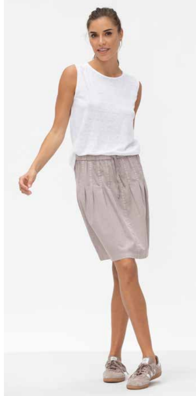
PHOTO 41 240143 ANY TOP WHITE 240120 ANEMONE SKIRT SMOKED POWDER