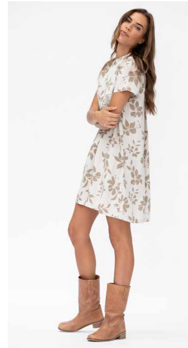
PHOTO 35 240129 ASHLEY DRESS KIT