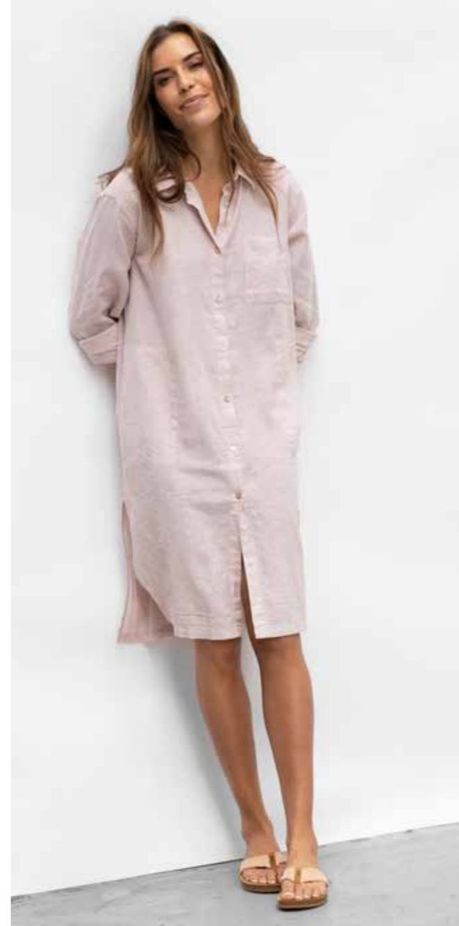
PHOTO 43 240127 ARIEL SHIRT DRESS SMOKED POWDER