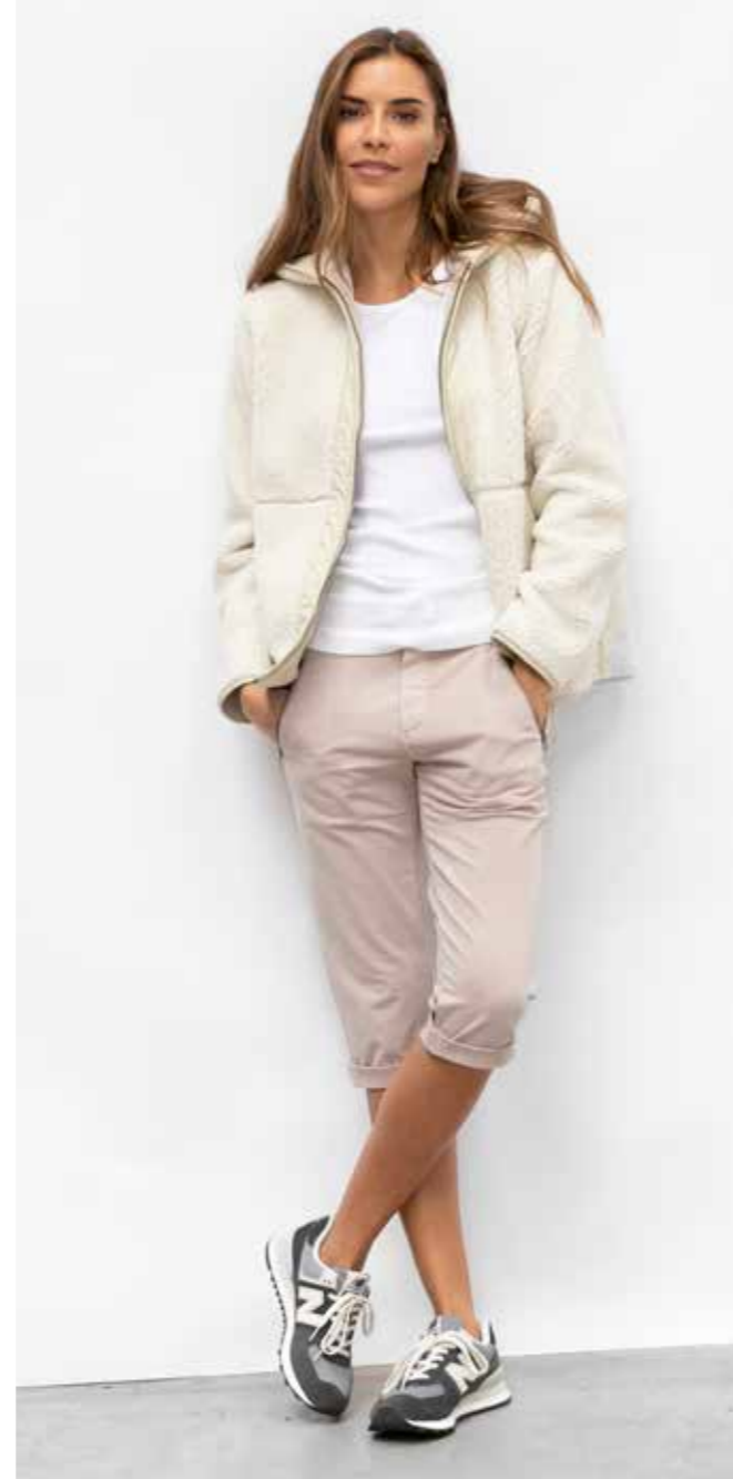
PHOTO 42 240103 AVEN TEDDY JACKET KIT 240179 BOA CAPRI PANTS SMOKED POWDER