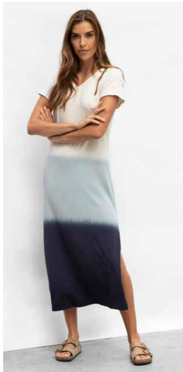
PHOTO 2 240146 AMANDA DRESS NEW NAVY