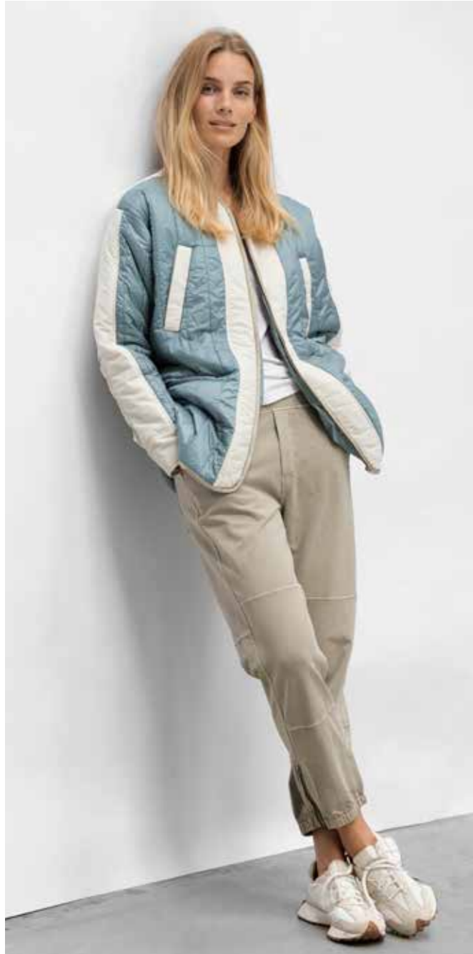
PHOTO 20 240100 AUGUSTA JACKET SEA 240176 BINE ANKLE CUT PANTS DARK KHAKI