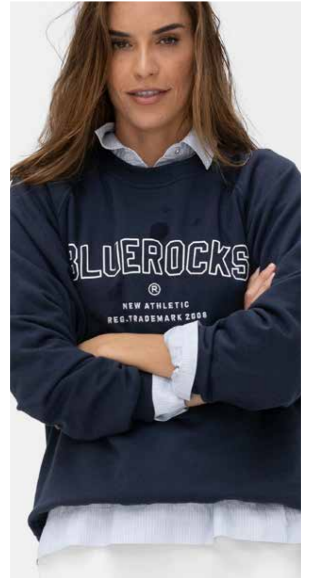
PHOTO 6 240166 BETT SWEAT NEW NAVY