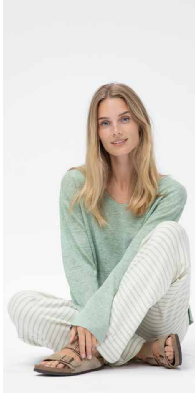
PHOTO 18 240110 AGNES KNIT SPRING GREEN MELANGE 240132 ALETTE RIB PANTS ECRU/SPRING GREEN STRIPES