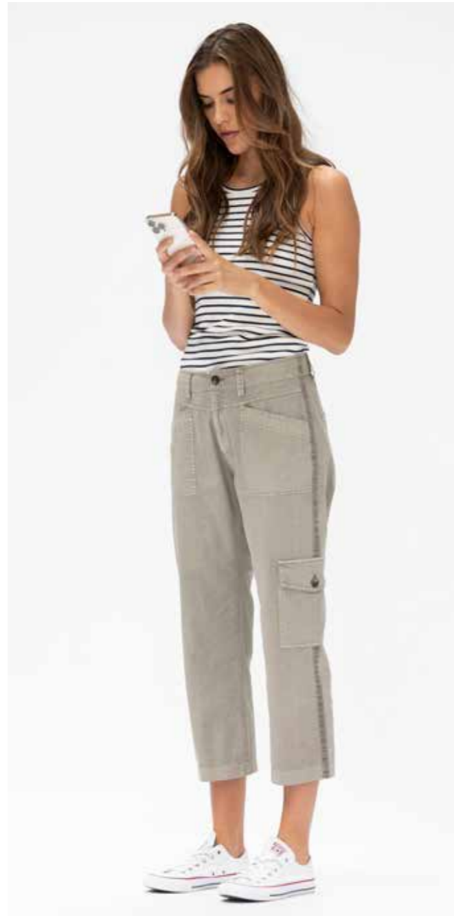
PHOTO 12 240157 SOREL RIB TANK TOP ECRU/NEW NAVY STRIPES 240119 ANEKE PANTS DARK KHAKI