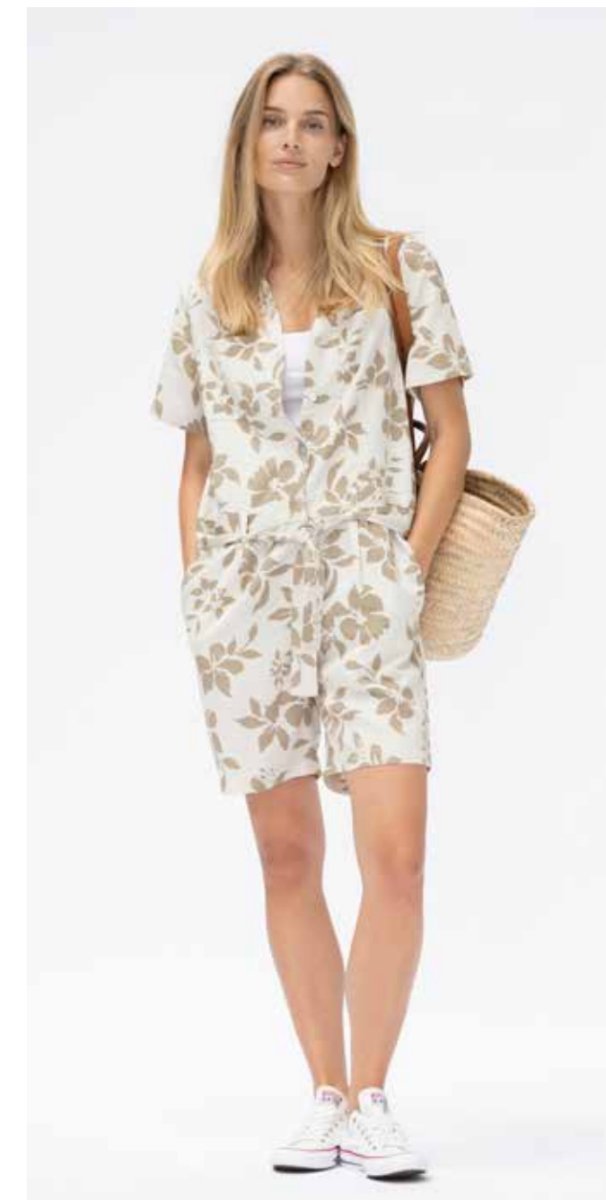
PHOTO 26 240128 ASTRID JUMPSUIT KIT