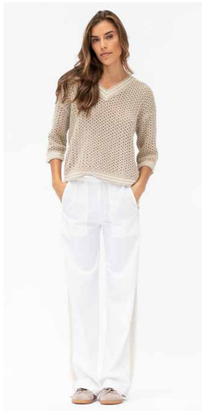
PHOTO 33 240113 ALEXANDRA KNIT CHALK 240114 ANNEMARIE TROUSERS WHITE WITH STRIPED TAPE