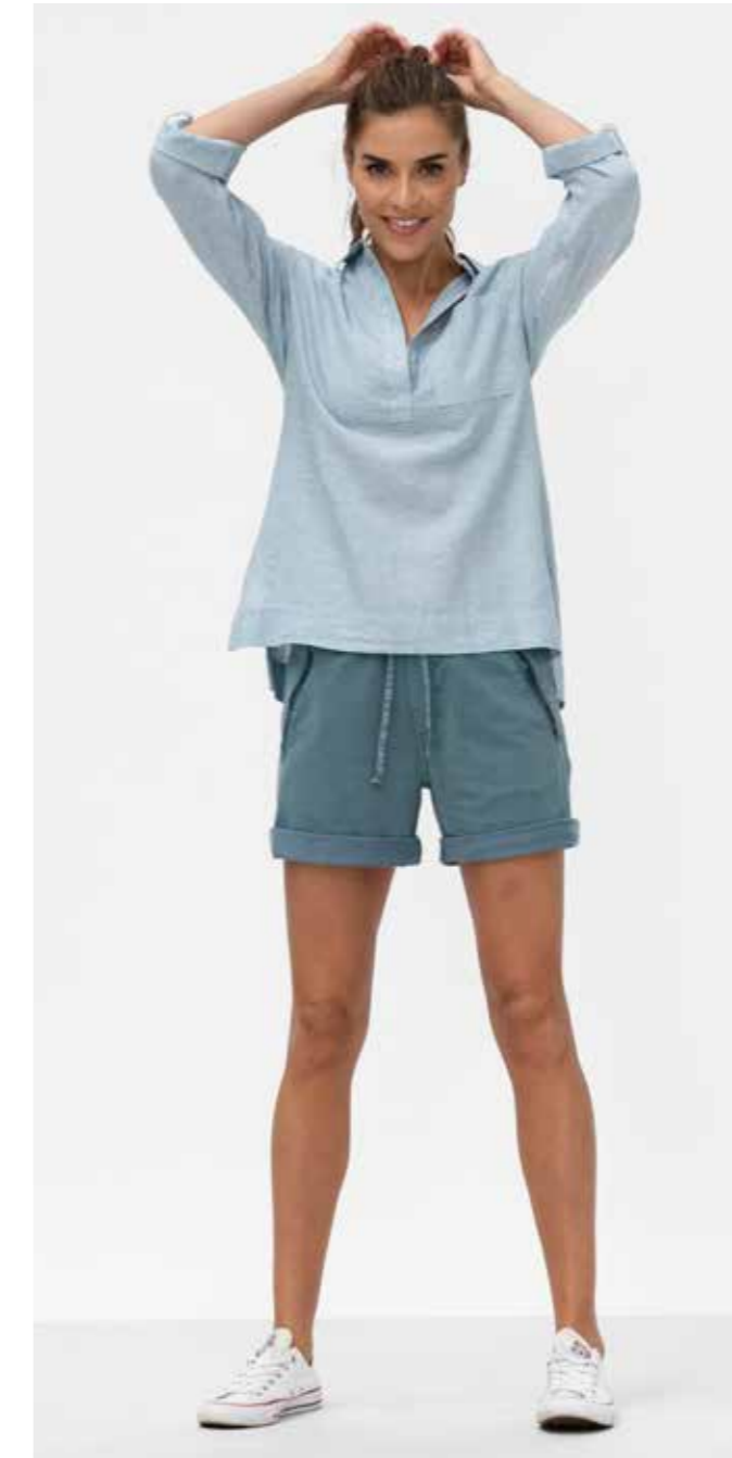
PHOTO 22 240126 ARIANA SHIRT SEA 240177 BINE SHORTS DARK SEA