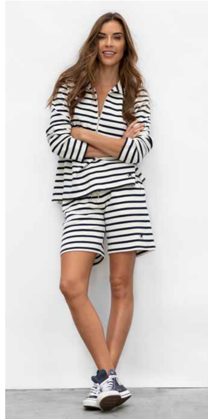
PHOTO 14 240171 BARBARA POLO BLOUSE ECRU/NEW NAVY STRIPES 240172 BARBARA BERMUDAS ECRU/NEW NAVY STRIPES