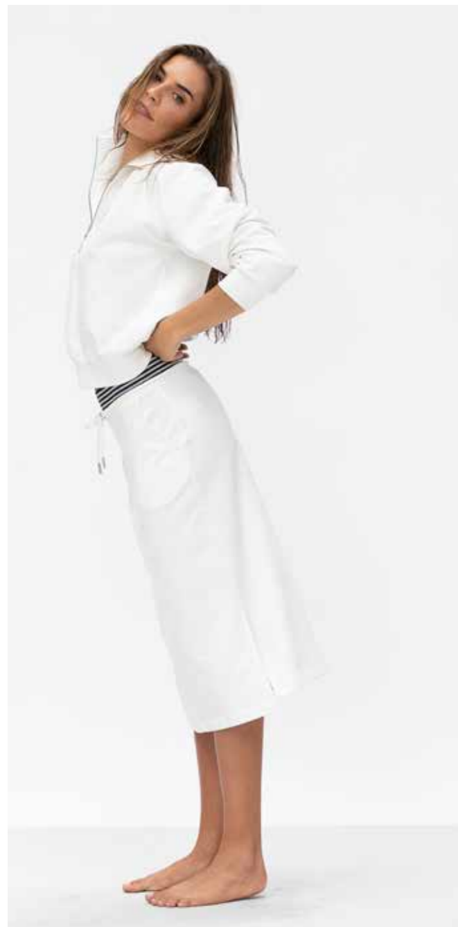
PHOTO 7 240160 BEATE SWEAT MILK 240162 BIBI SKIRT MILK