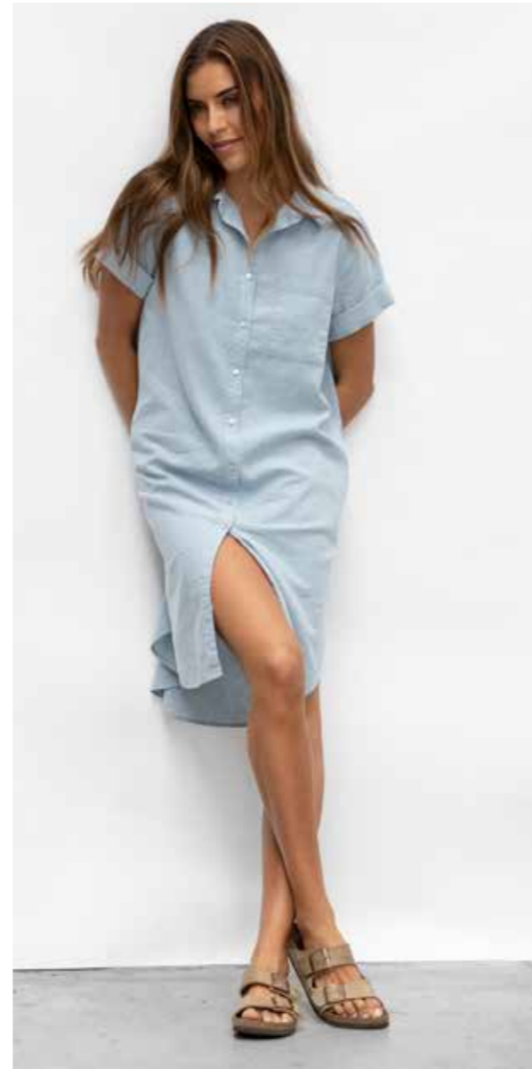
PHOTO 3 230166 JULIANA DRESS HEAVEN