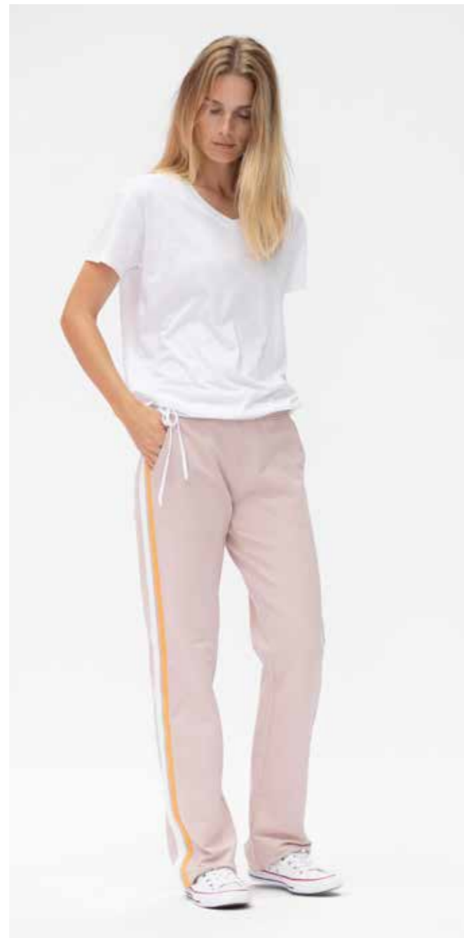
PHOTO 37 240136 ALPHA TEE WHITE 240169 BEATRICE PANTS SMOKED POWDER