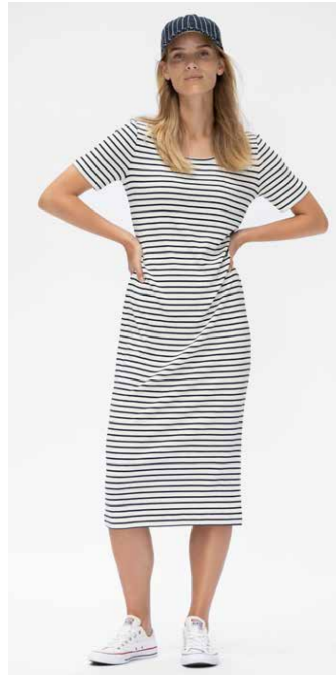
PHOTO 13 240133 ALMA RIB DRESS ECRU/NEW NAVY STRIPES