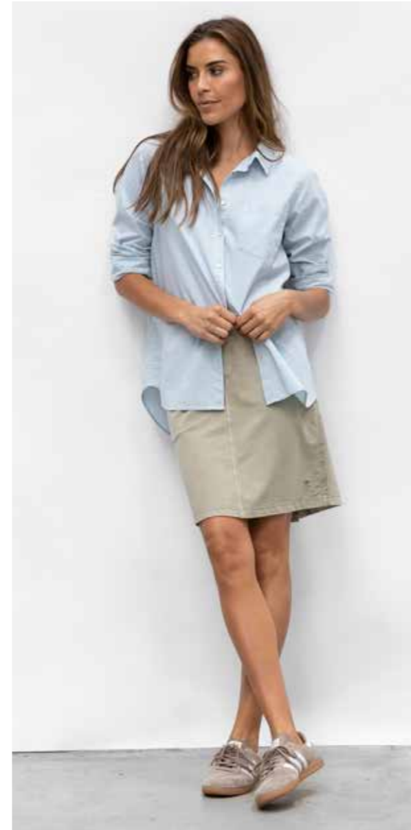
PHOTO 4 240125 APRIL SHIRT HEAVEN 240180 BINE SKIRT DARK KHAKI