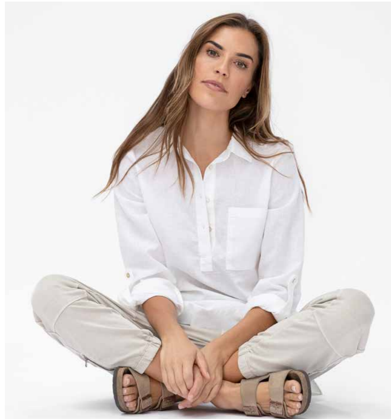
PHOTO 34 240126 ARIANA SHIRTS WHITE 240176 BINE ANCKLE CUT PANTS CHALK