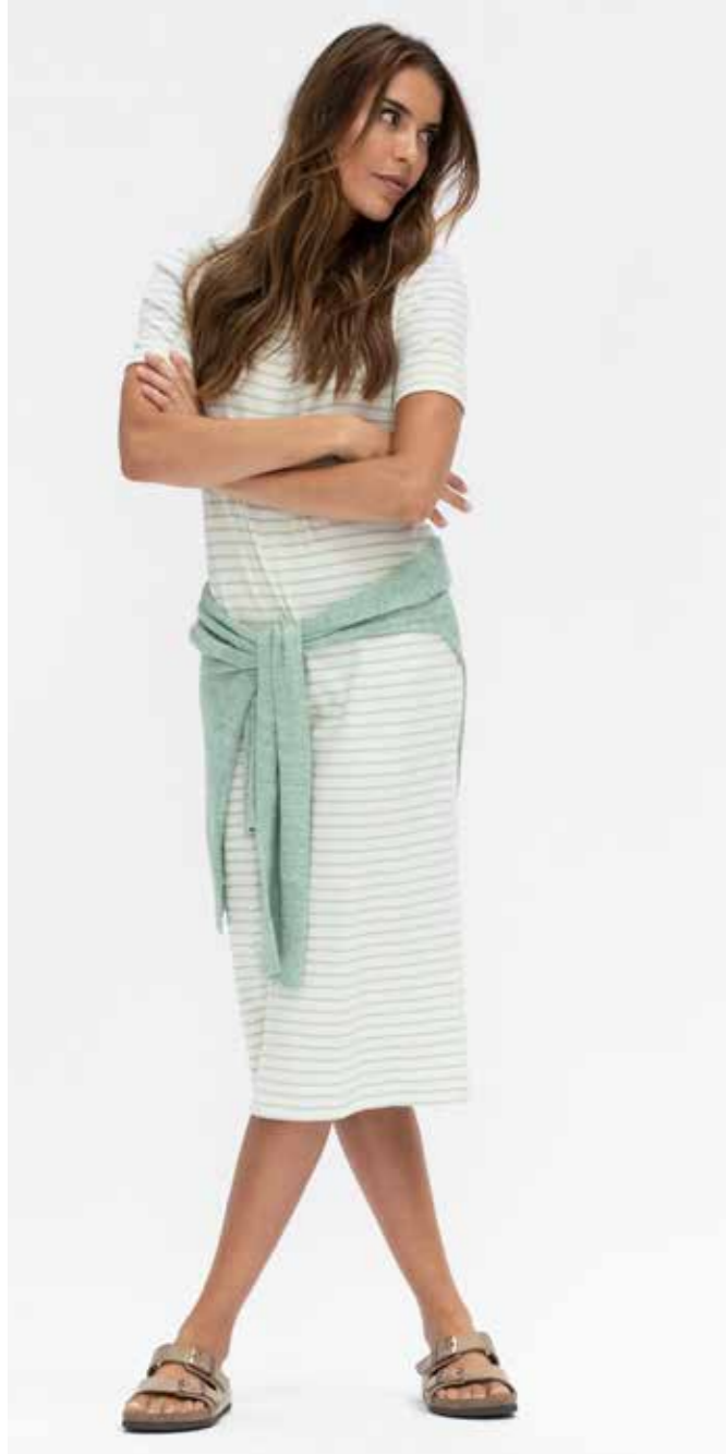
PHOTO 17 240133 ALMA RIB DRESS ECRU/SPRING GREEN STRIPES