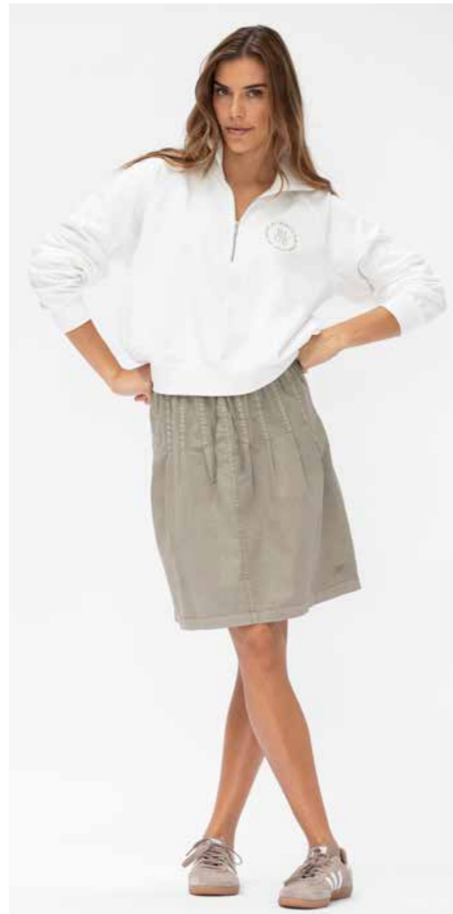
PHOTO 32 240160 BEATE SWEAT MILK 240120 ANEMONE SKIRT DARK KHAKI