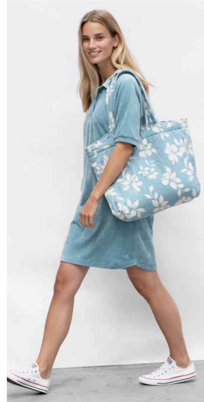
PHOTO 23 240182 BIRKA VELVET POLO DRESS SEA 240192 ALABAMA BAG SEA