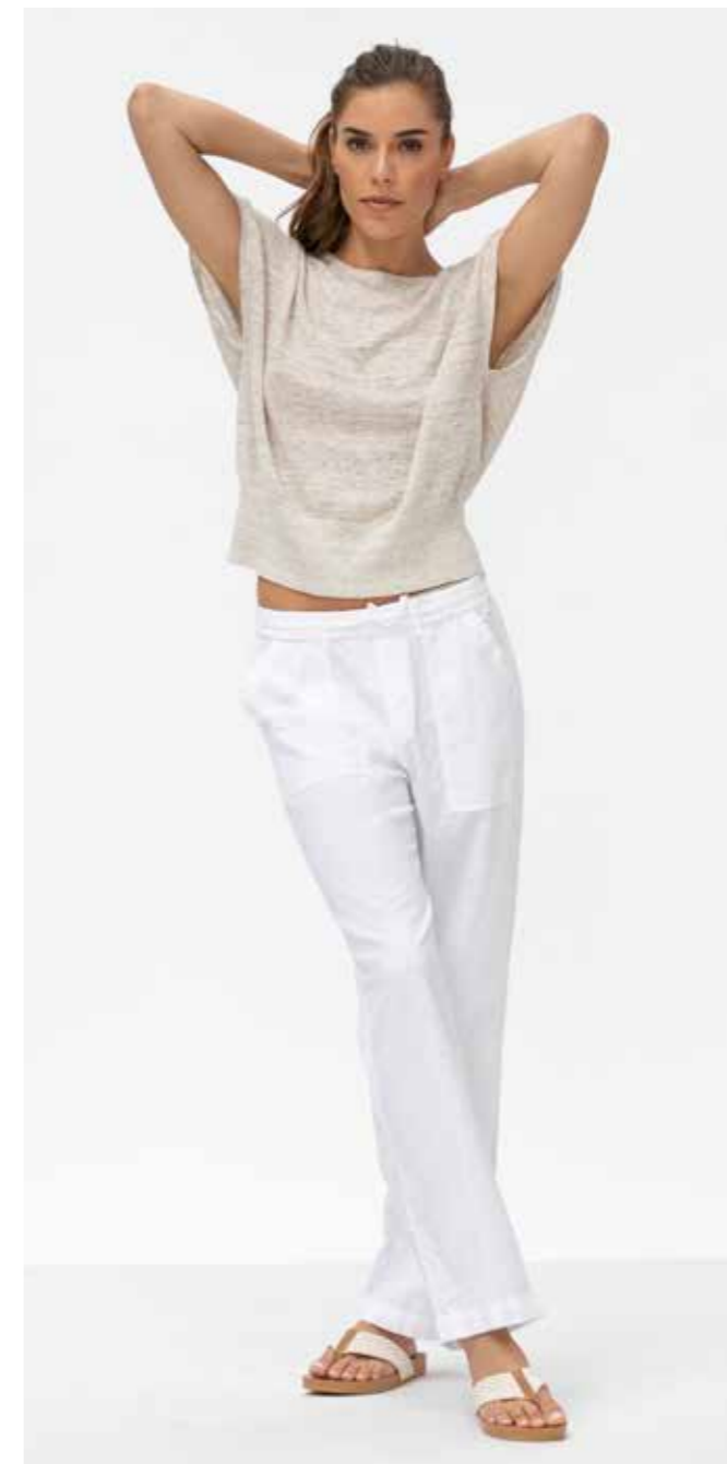
PHOTO 29 240111 ASTA KNIR CHALK MELANGE 230151 JASMINE TROUSERS WHITE