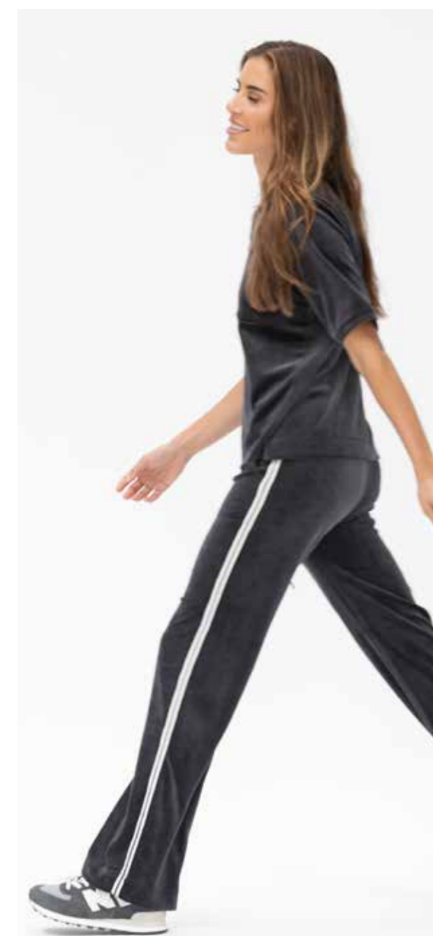
PHOTO 30 240181 BIRKA VELVET BLOUSE IRON GREY 240183 BIRKA VELVET PANTS IRON GREY